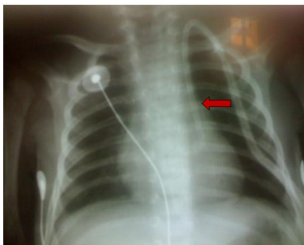
Figure 1: On routine post-procedural X-ray, an unusual course of the catheter was identified.

On routine post-procedural X-ray, an unusual course of the catheter was identified (Figure 1).