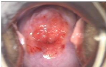
Figure 1: Colposcopic visualization of cervix.

Colposcopic findings were compared with cytology and histopathological examination. Accuracy of colposcopic examination was calculated by standard statistical methods. Sensitivity, specificity, Positive Predictive Value (PPV) and Negative Predictive Value (NPV) of colposcopic examination was calculated.