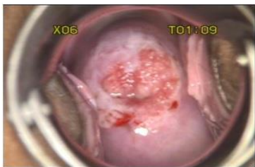
Figure 2: Cervix after application of acetic acid.