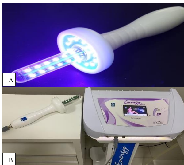
Figure 3 (A and B): Blue LED device and blue LED device on, Energy model, DGM®.

The intervention will comprise five sessions of treatment or sham with insertion of the device with gel heated to 38°C lasting 8 minutes with a 7-day interval between sessions. The LED sham sessions will follow the same pattern of treatment; however, the device will be turned off. A 405±5 nm blue LED (Figure 3) with a power of 30 W and a mean irradiance of 0.000773 W/cm 2 , and consistent insertion with 38°C heated gel will be used. Then, patients will receive pelvic kinesiotherapy sessions as per the department protocol (2xseries of 10 sustained contractions of 5s each, interchanging with 10s of relaxation and 2x series of maximum fast contractions, interchanging with 4s of relaxation).